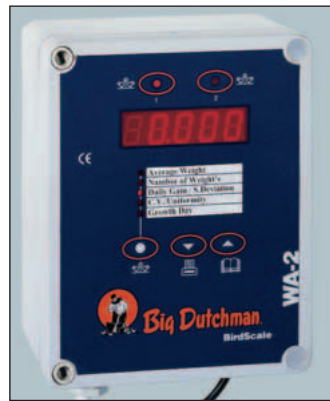
WA 2 weighing computer

The weighing platform of both Big Dutchman bird scales is made of film-coated waterproof wood. This material excels by its high durability, can be cleaned thoroughly and is well accepted by the birds, in which case a great number of weighings and thus a more precise weight determination can be achieved. Both scales are hanging down from the ceiling and should be suspended as low as possible so that even the laziest (heaviest) birds can step onto the weighing platform. The height of the scales can easily be adjusted. Moreover, they can be removed for cleaning without problems. The electronic parts of the scale are installed into the ceiling and are therefore protected against dirt (manure and litter).