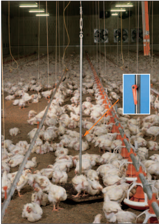
Broiler house with SWING 20

SWING 20 is the ideal bird scale for broiler and broiler breeding management (weighing capacity of up to 20 kg). SWING 70 is perfectly suited for turkey management (weighing capacity of up to 70 kg).