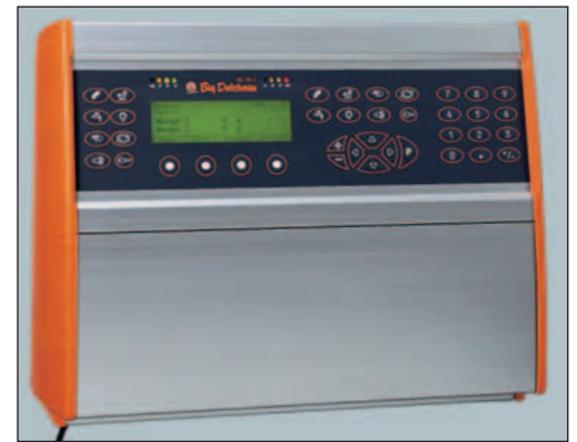
MC 95 production computer or MC 95 BW8

Both scales can either be connected to the WA 2 weighing computer (for 2 scales), or to the MC 95 BW8 (for 8 scales), or to the MC 95 production computer (for 2 scales per partition). The following data can be displayed: