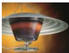
Solaire™ infrared radiant brooder

Big Dutchman brooders Big Dutchman's Solaire™ Infrared Radiant Brooder radiates heat