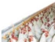
Nipple watering system