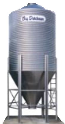
Bulk feed silo

..... Ask your Big Dutchman representative for more information on Big Dutchman components.